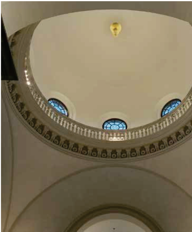
PSI-20 with surface cover AH-C at a height of 20m