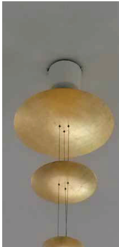
Close-up PSI-20 with AH-C